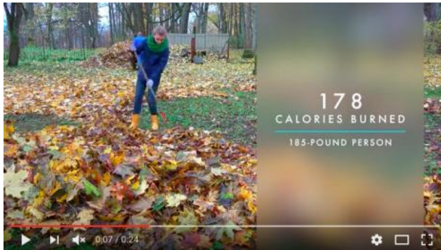
"Everyday Activity" Exercise Videos